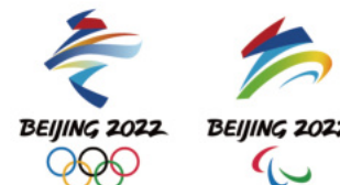
The 2022 Beijing Winter Olympic Games & Paralympic Games.