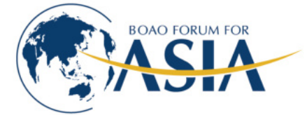
The 2013 Boao Summit for Asia in Hainan.