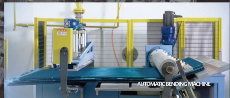
AUTOMATIC BENDING MACHINE

Hien is a leading brand in the Chinese heat pump industry, integrating product research and development, equipment production, sales, and service. Our products cover four major areas: cooling and heating, hot water, drying, and swimming pool heat pumps. We have the capacity to produce 1 million air source heat pumps annually, and we empower every stage of product manufacturing with advanced modern processing and manufacturing equipment.