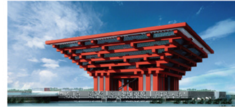
The 2008 Shanghai World Expo.