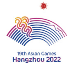
2023 the Asian Games in Hangzhou