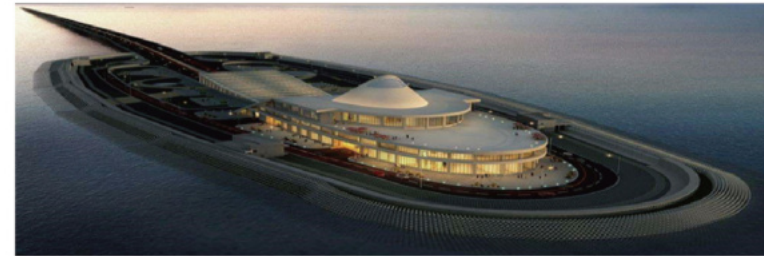
The artificial island hot water project of the Hong Kong-Zhuhai-Macao Bridge in 2019.