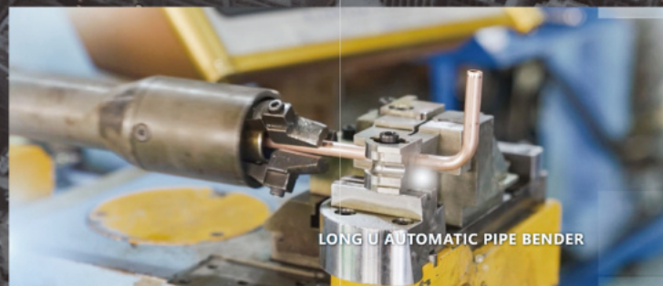
LONG U AUTOMATIC PIPE BENDER